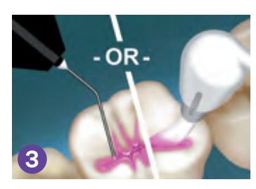
Apply Clinpro™ Sealant into pits and fissures.